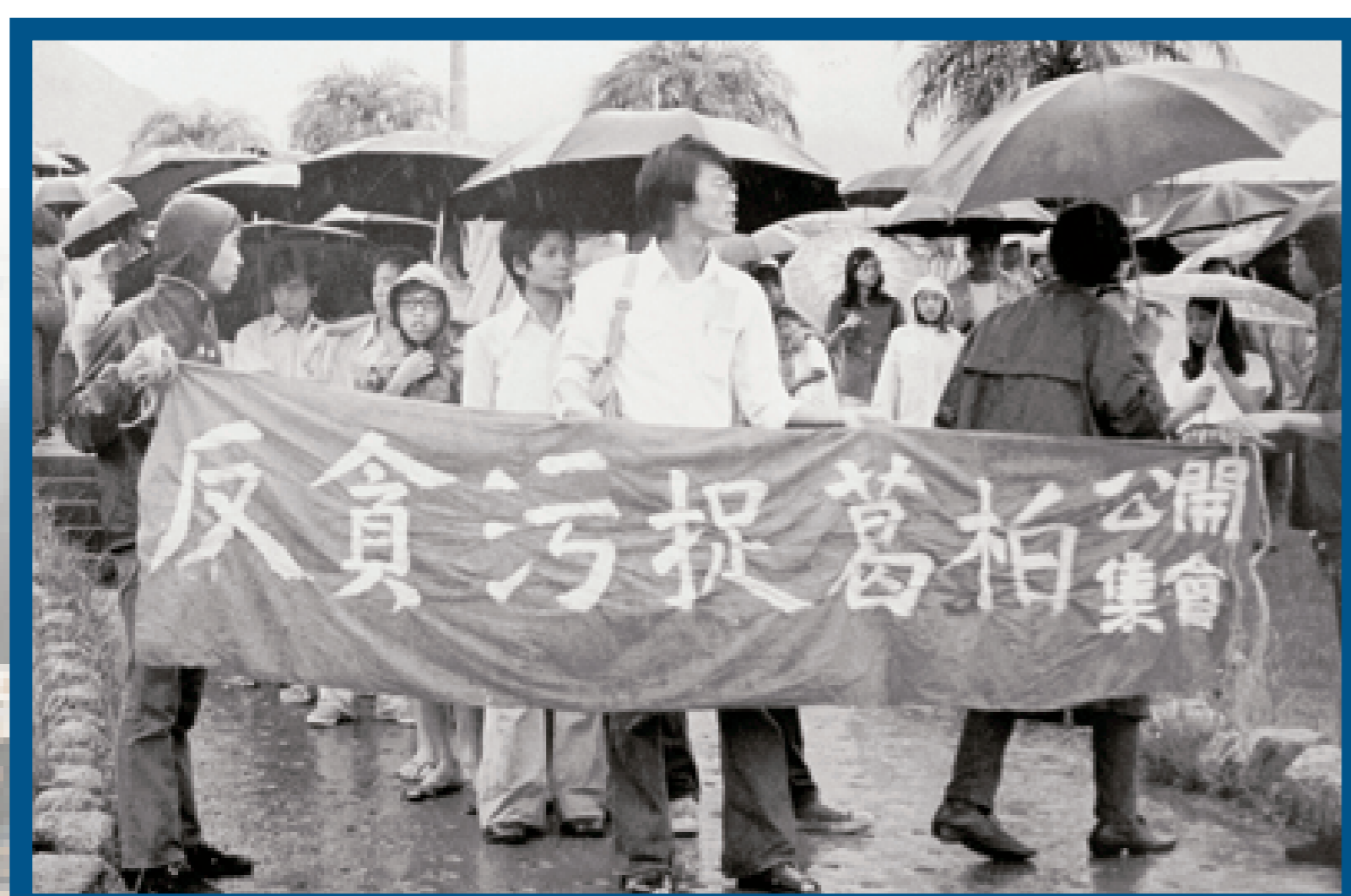
The escape of a corrupt Police Chief Superintendent led to a fervent call on the Government to root out corruption 涉嫌受賄總警司潛逃海外激起民憤，市民要求政府肅清貪污