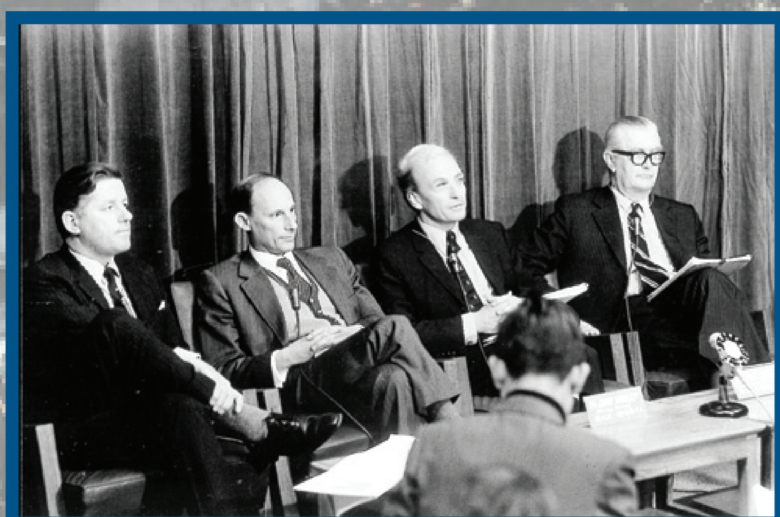
The establishment of the ICAC in 1974 was the landmark of the fight against corruption in Hong Kong 廉政公署於1974年成立，標誌著香港打擊貪污的決心