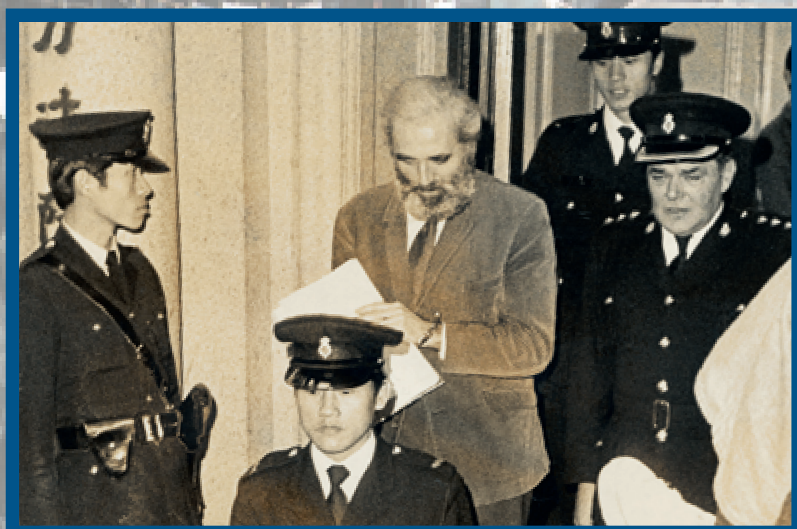
The corrupt Police Chief Superintendent was finally extradited to Hong Kong for trial 貪污總警司最後被引渡回港接受審訊