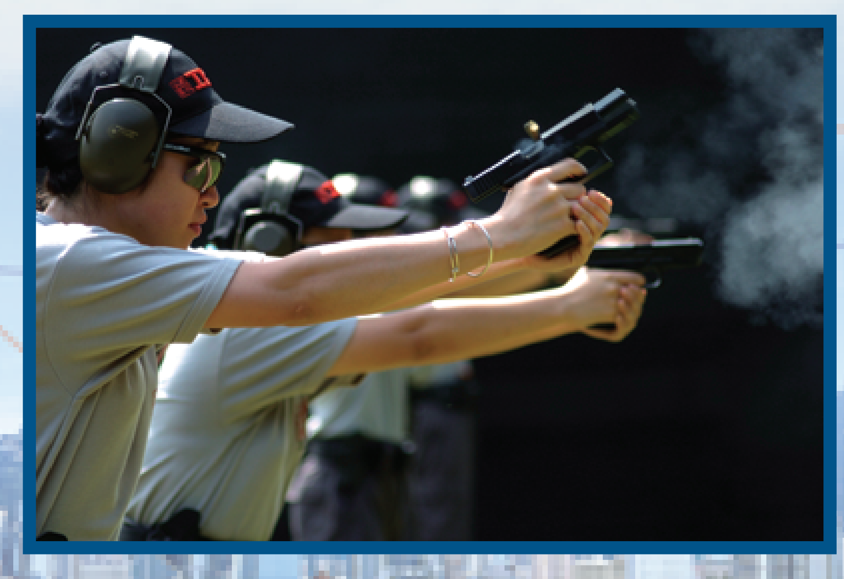
Firearms to provide operational suppo 槍械訓練有助執行職務