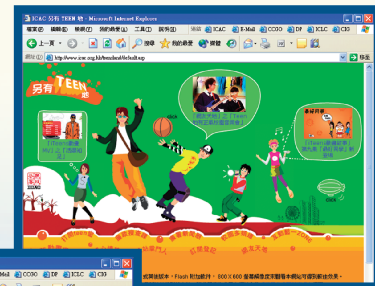
Promotion of ICAC messages through the Internet 透過互聯網以互動方式傳遞廉潔信息