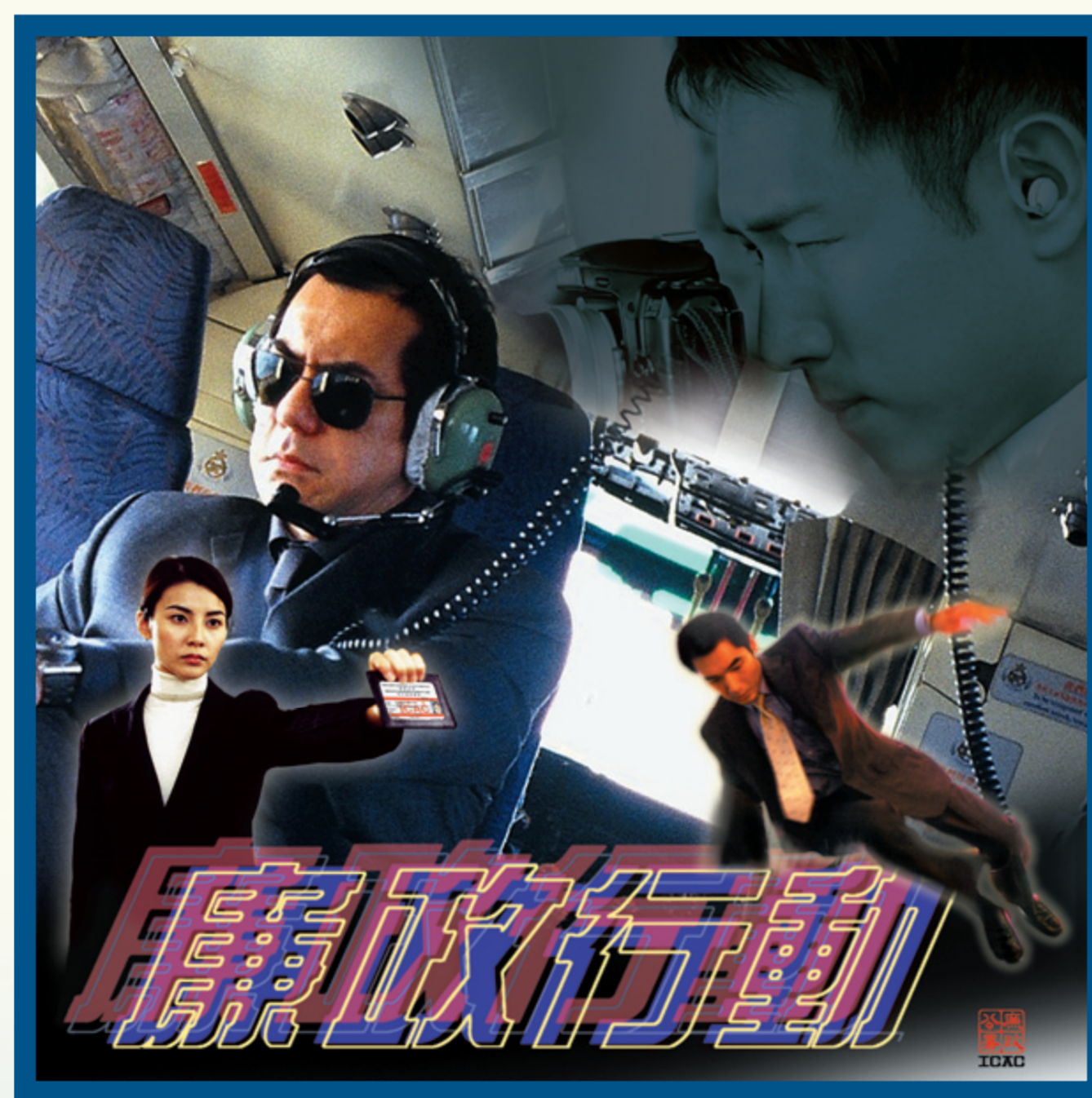
Educating the public about corruption's evils through TV drama 透過電視劇宣傳貪污的禍害