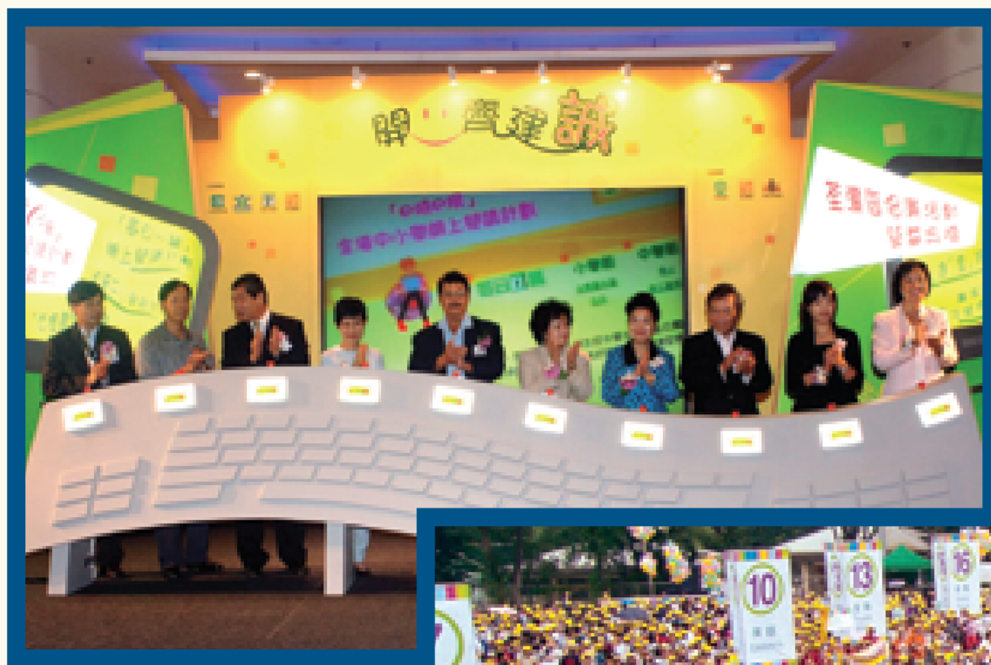
Launch of the "Integrity Enhancement" E-Reading Students Participation Programme 「網上閱讀計劃」宣揚正面價值觀

社區關係處的法定職責是教育公眾認識貪污的禍害，並透過面對面接觸、大眾傳媒和互聯網爭取市民支持，共同打擊貪污。同時，社區關係處亦積極加強與私營及公營機構的合作，在社會上鞏固廉潔文化，在企業內推廣商業道德，並向年青一代灌輸正確的價值觀。