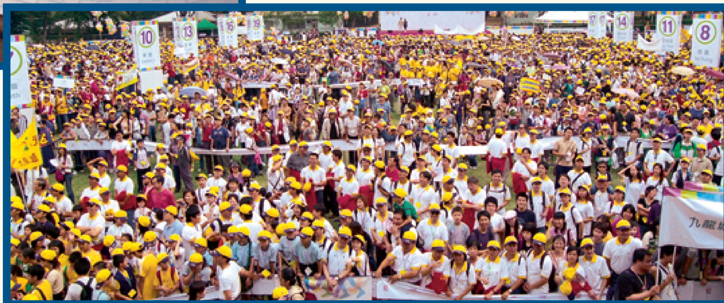
Nearly 10,000 people from Hong Kong's 18 districts poised to leave their footprints at the ICAC's 30th Anniversary Walk 全港十八區近萬市民參與廉署三十周年「你我同心 共建廉政」慈善萬人行