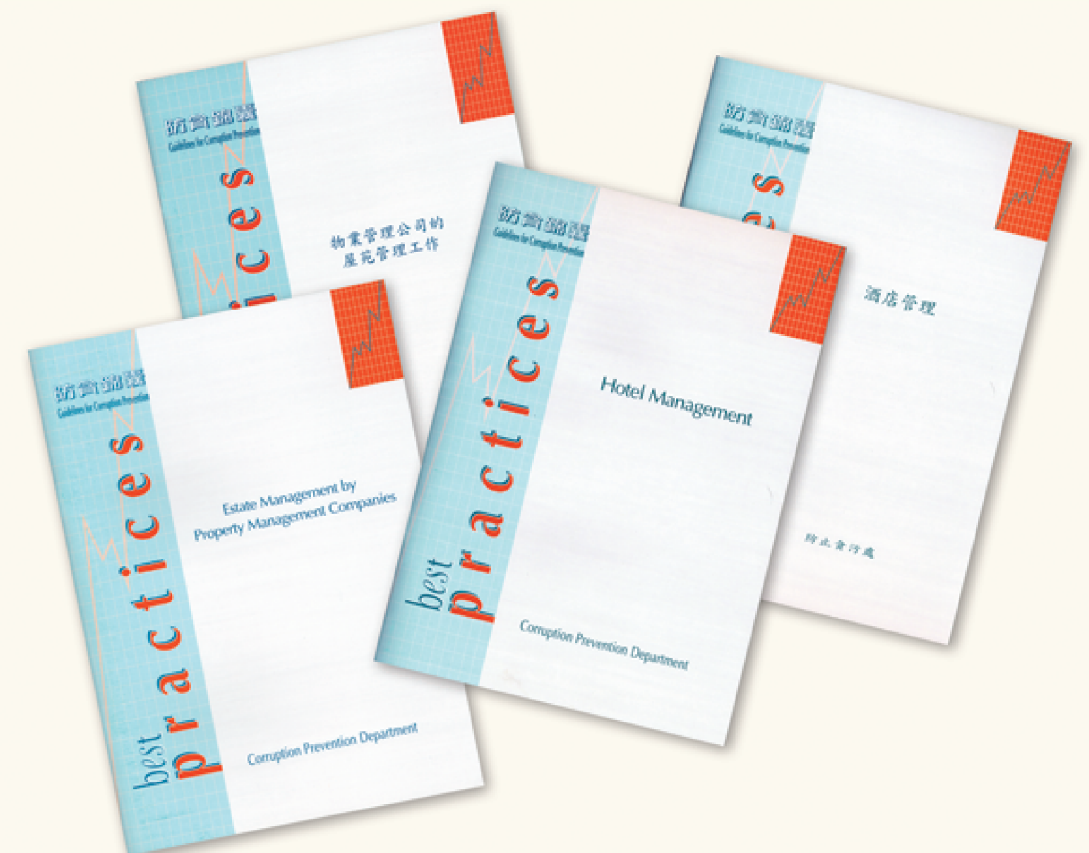
The latest modules are on estate management and hotel management 最新製作的《防貪錦囊》探討屋苑管理和酒店管理的防貪措施

ASG assists individual private sector companies, large or small, to formulate codes of conduct for staff and to improve business operations by enhancing internal controls and plugging corruption loopholes. So far over 3,000 companies/organisations have used ASG services. ASG also seeks to partner with trade bodies to help promote a clean business environment and good industry practice in particular through the compilation of a series of Best Practice Modules.