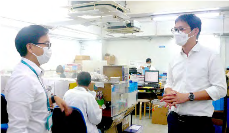
防貪處人員檢視廠商會檢定中心的運作 A CPD officer examining the operation of CMA Testing