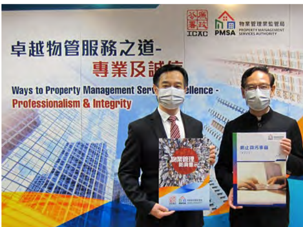
防貪處與物業管理業監管局合辦持續專業發展講座 CPD and PMSA co-organising a Continuing Professional Development Seminar

CPD continued to work closely with the Property Management Services Authority (PMSA) to assist licensed property management companies (PMC) to establish an IMS. CPD offered input to PMSA’s codes of conduct and related guidelines for licensees, setting out the integrity requirements and guidance in procurement, outsourcing of services, and staff recruitment and management by PMC. In October 2022, CPD and PMSA jointly organised a Continuing Professional Development Seminar on “Ways to Property Management Service Excellence – Professionalism and Integrity” to exchange views on integrity management with over 150 practitioners. CPD also provided corruption prevention advice and training to individual property management companies upon request. CPD will continue to collaborate with PMSA to strengthen the integrity standard and corruption prevention capabilities of the industry.